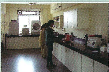
State of the art testing laboratory