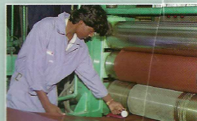
In process Quality check.