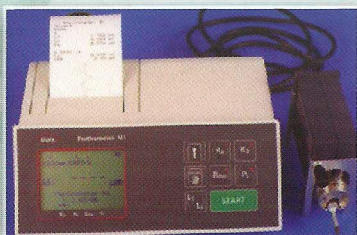
Pertho Meter for checking surface roughness

Our Testing Laboratory screens every raw material that goes into the production of Cots & Aprons to make sure that the quality of our products remains uniformly high & consistent. Our R & D team is always at your service to produce innovative products, which will give an edge over other manufacturers.