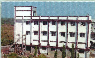
One of the three production facility at Daman