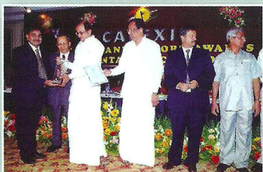
Receiving Award for Export Excellence