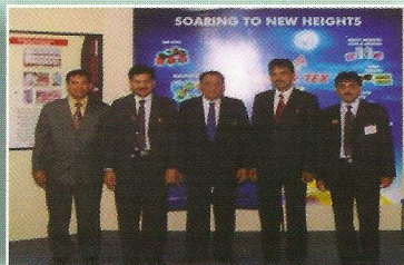
Professional & Experienced Promoters with high Entrepreneur skills.

Super Tex is a part of Pansari Group serving the Textile Industry since last 30 years. After successfully manufacturing & marketing Acrylic Dyes in India (the only company doing so), floated yet another challenging product under its umbrella for the manufacture of Cots & Aprons in the year 1996.