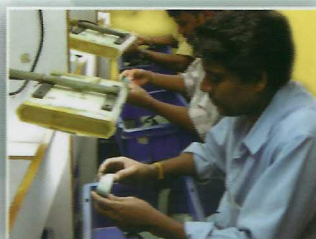
100% inspection of finished product.

Production & Inspection: We do not rest on our laurels but our Production and R & D department, headed by highly qualified Rubber Technologist is continually working to produce very innovative & technologically advanced product to meet client's requirement of tomorrow.